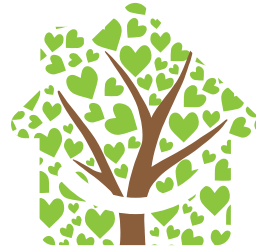
Caring for Community ♡