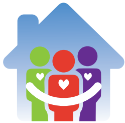
Caring for People ♡

HomeServe North America, part of HomeServe plc, funds the HomeServe Cares Foundation. The Foundation's funds are used to support a variety of programs and services in the U.S. and Canada.