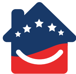
Caring for Vets ♡