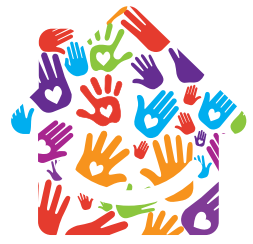
Caring for Good ♡